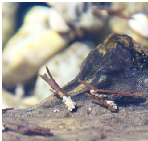
Figure 2: Caddisflies in Upper Seebach in Lunz am See. You can see moving needles or stones in the water that the caddisflies used to build their caddis with.